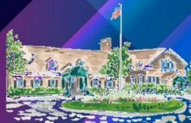
HERITAGE CLUB at Bellfrye