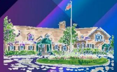
HERITAGE CLUB at Bellvue